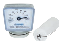
Gauge PN: 962247 – 720 L / 962248 – 1000 L