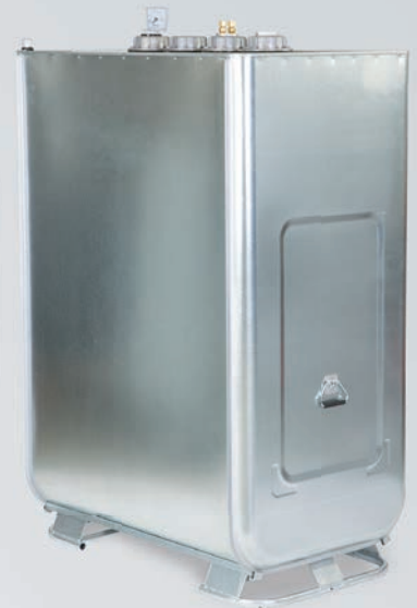
2 IN 1 TANK